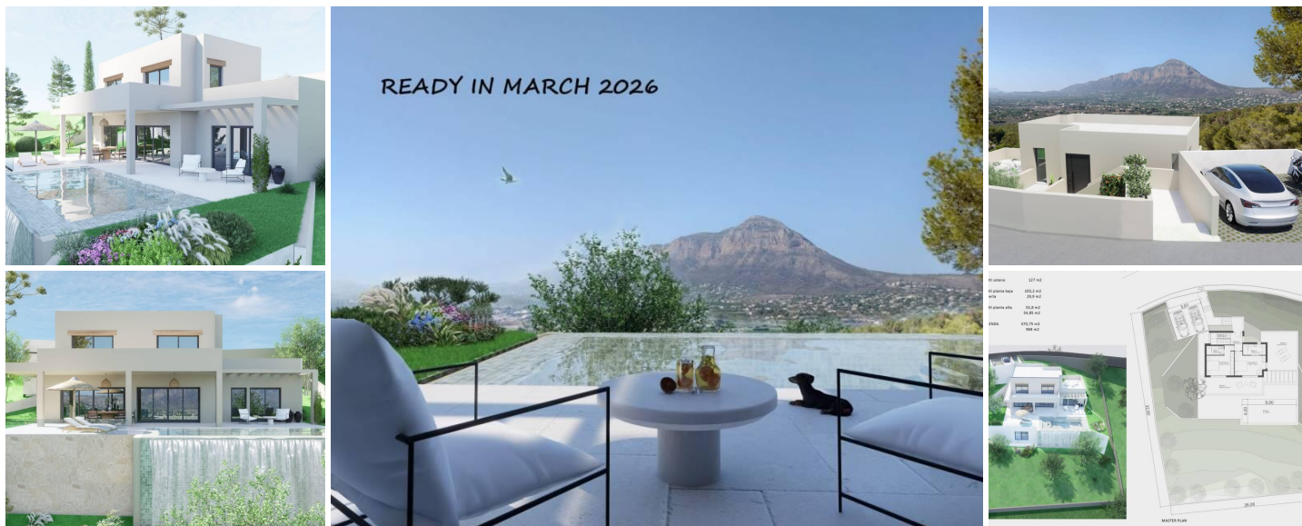
New build villa for sale in Rafalet, Jávea

This villa will be ready by March 2026 (subject to change) and is located in the Rafalet urbanisation 3 km from Jávea beach.