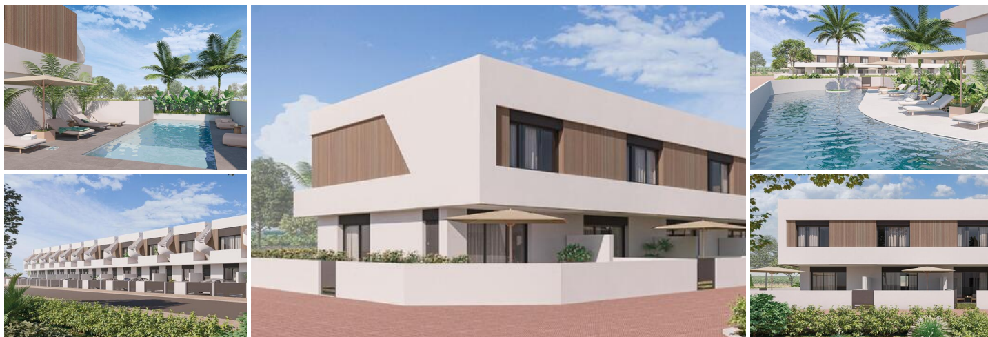
New Build Townhouses and Corner Townhouses in Pilar de la Horadada