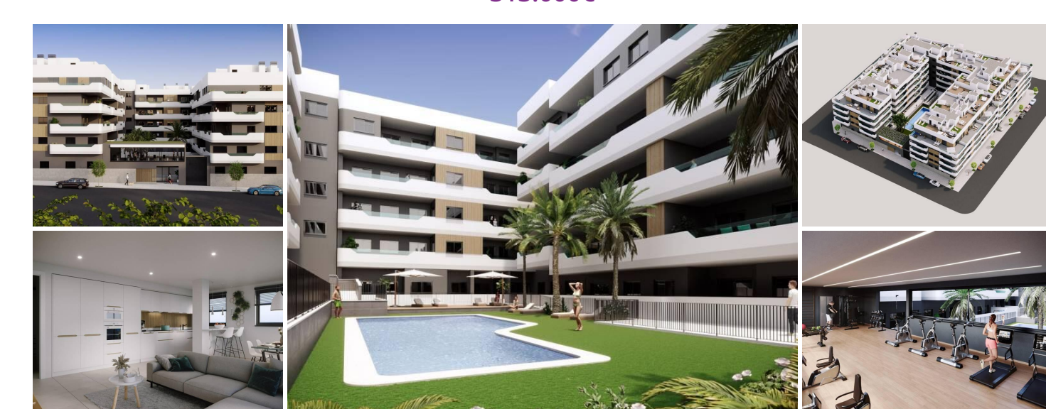
NEW BUILD RESIDENTIAL COMPLEX IN SANTA POLA

New Build modern gated residential complex consisting of 1, 2 and 3 bedroom apartments and penthouses with 2 complete bathrooms. The complex consists of 4 staircases of flats with spacious landscaped communal areas, including swimming pool, relaxation area and gymnasium.