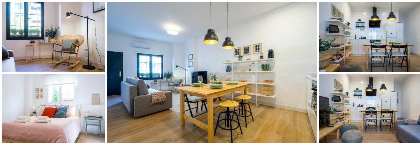
A One Bedroom Apartment For Winter Rental Located Near The Beach And Town

The apartment has been recently renovated, with aircon and heating. Has A Communal roof terrace with pool and views to the sea and mountains. The kitchen has a full oven and ceramic hob.