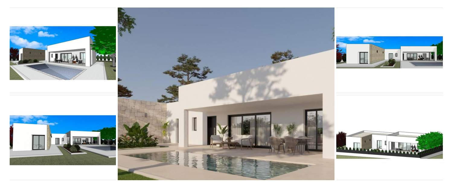
NEW BUILD VILLAS IN PINOSO