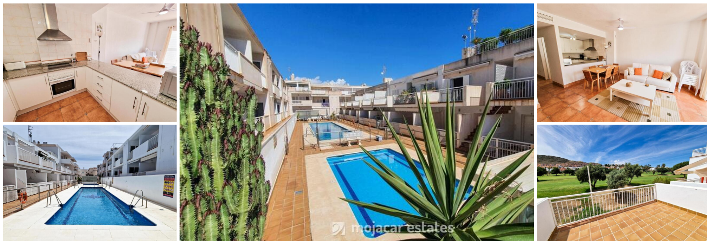
Marina Golf Ness

Top floor apartment for 4 people conveniently located between golf & beach with wonderful golf course views.