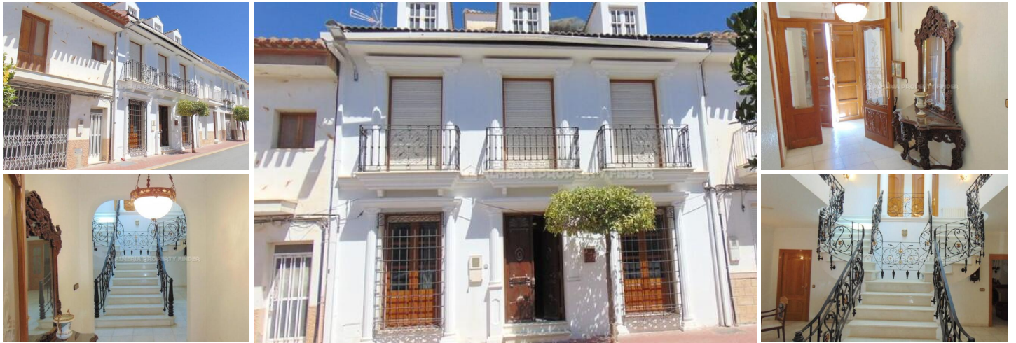
Casa Romero - A town house in the Cantoria area. (Resale)

*** EXCLUSIVE TO ALMERIA PROPERTY FINDER ***