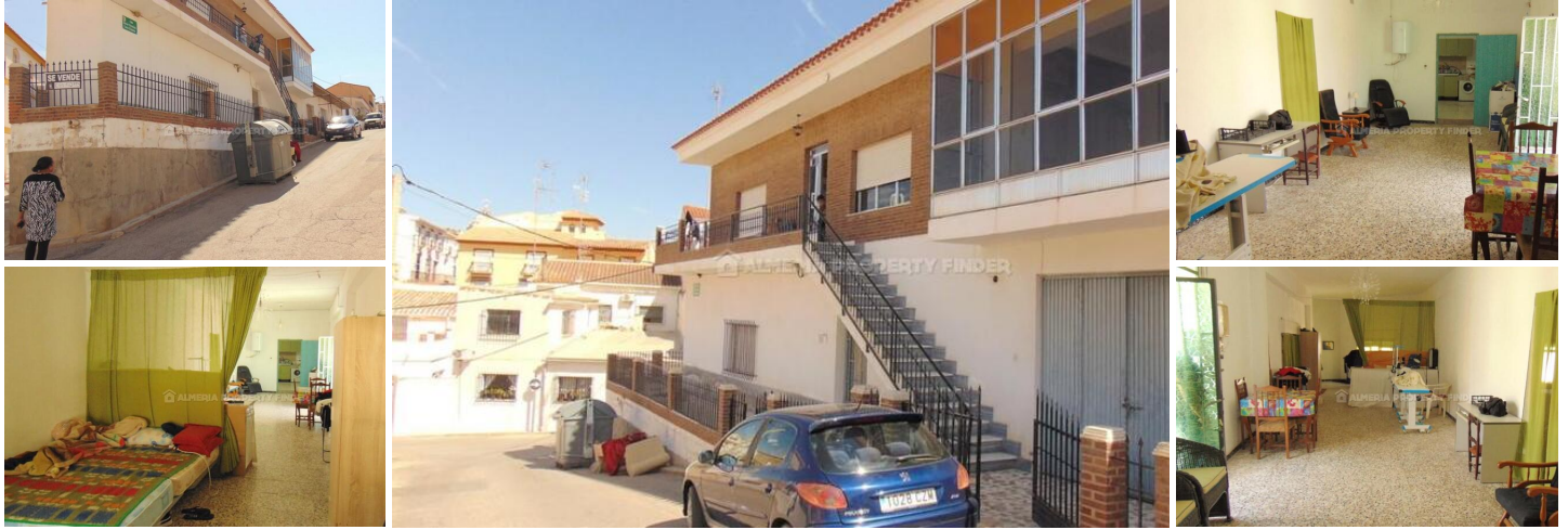
Casa Elena - A town house in the Zurgena area. (Resale)

This large village house is located in the center of Zurgena. Consists of a large open ground floor, garage, 2 bathrooms, 3 bedrooms, fitted kitchen, living and dining area, terrace and a city garden of 250 m 2