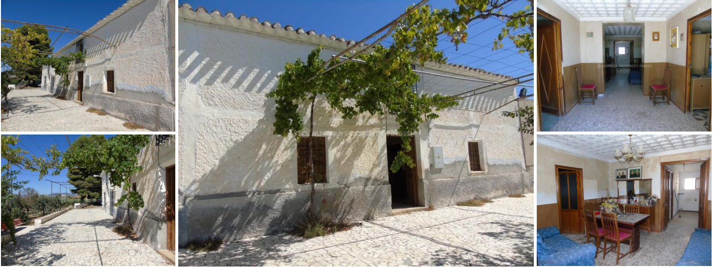
Casa Diego - A country house in the Albox area. (For Renovation)

A terraced habitable 2 bedroom country house for modernisation, on a plot of 481m 2 to include a large garage and garden. Additional land is available at separate negotiation.