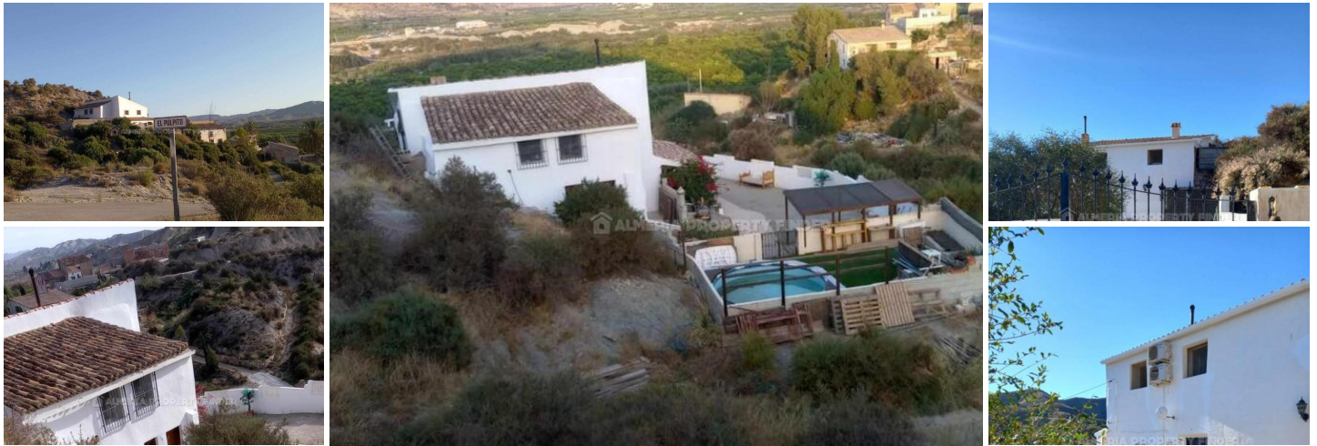
Cortijo El Pulpito - A country house in the Almanzora area. (Renovated)