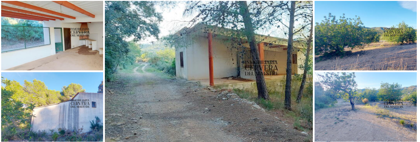
Land with property in cervera del maestre

Rustic property in the municipality of Cervera del Maestre less than 1 kilometer from the town with the possibility of connection to the municipal drinking water network.