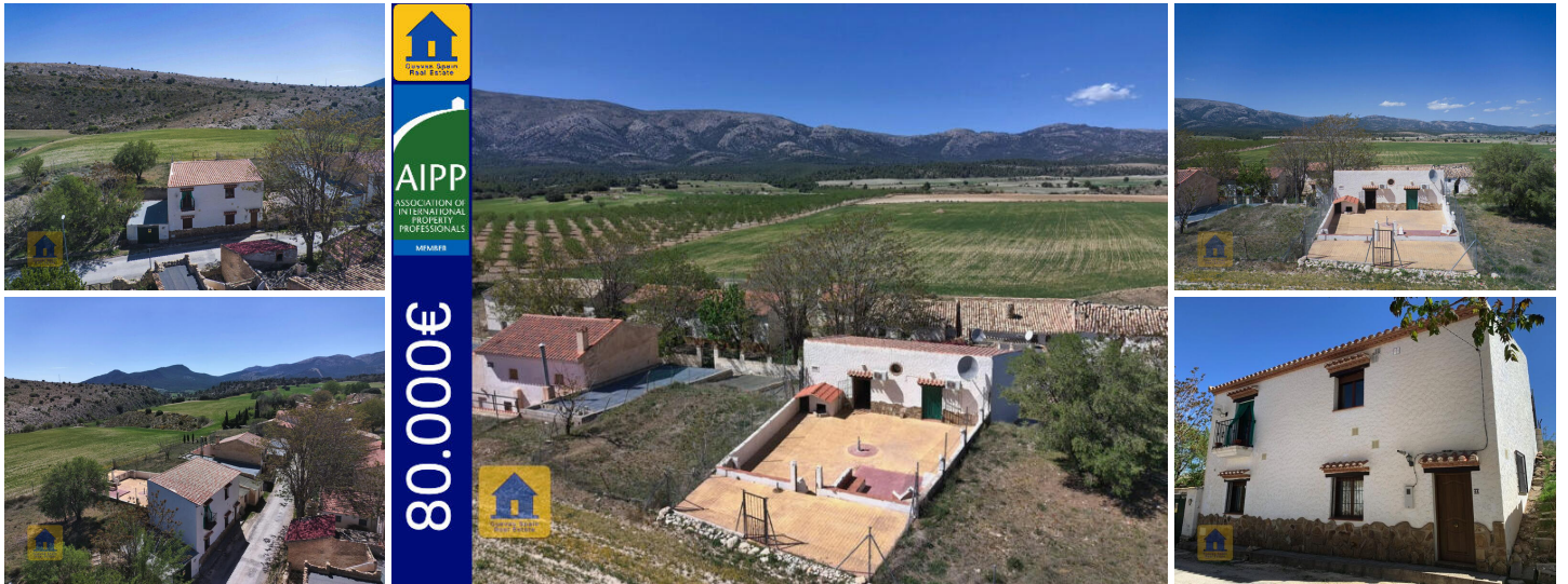
Casa Leslie in San Clemente

Casa Leslie is a beautiful, bright 2-story house in the peaceful country hamlet of Canal de San Clemente. The road into the hamlet crosses an ancient Roman stone bridge and dead ends at the other end of the hamlet so there is no through traffic. Canal de San Clemente is surrounded by rolling hills of farmland, with stunning views of the Sierra de Castril mountains to the east, and La Sagra, the highest mountain of the region (2383m), to the north.