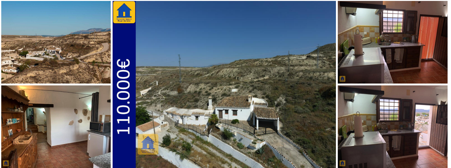
Galera Cave House Audrey

Two beautiful connected cave houses in the heights of Galera. The caves are totally independent and are designed to be lived in either separately or as one home. Each one has a large terrace with fantastic views facing west and sun all day long. The cave to the right (facing the caves) is a spacious 1-bedroom with sleeping space for 2 guests in the living room, carport and utility room. The cave on the left has 3 double bedrooms, one with walk-in closet. Both caves have kitchens with views over the valley. Both have spacious bathrooms. Parking space in the driveway, more parking at the front. Less than 10 minutes walk to Galera village where you will find all amenities, tapas and restaurants. Easy access, just 2-3 minutes off the main road to Huéscar or Baza.