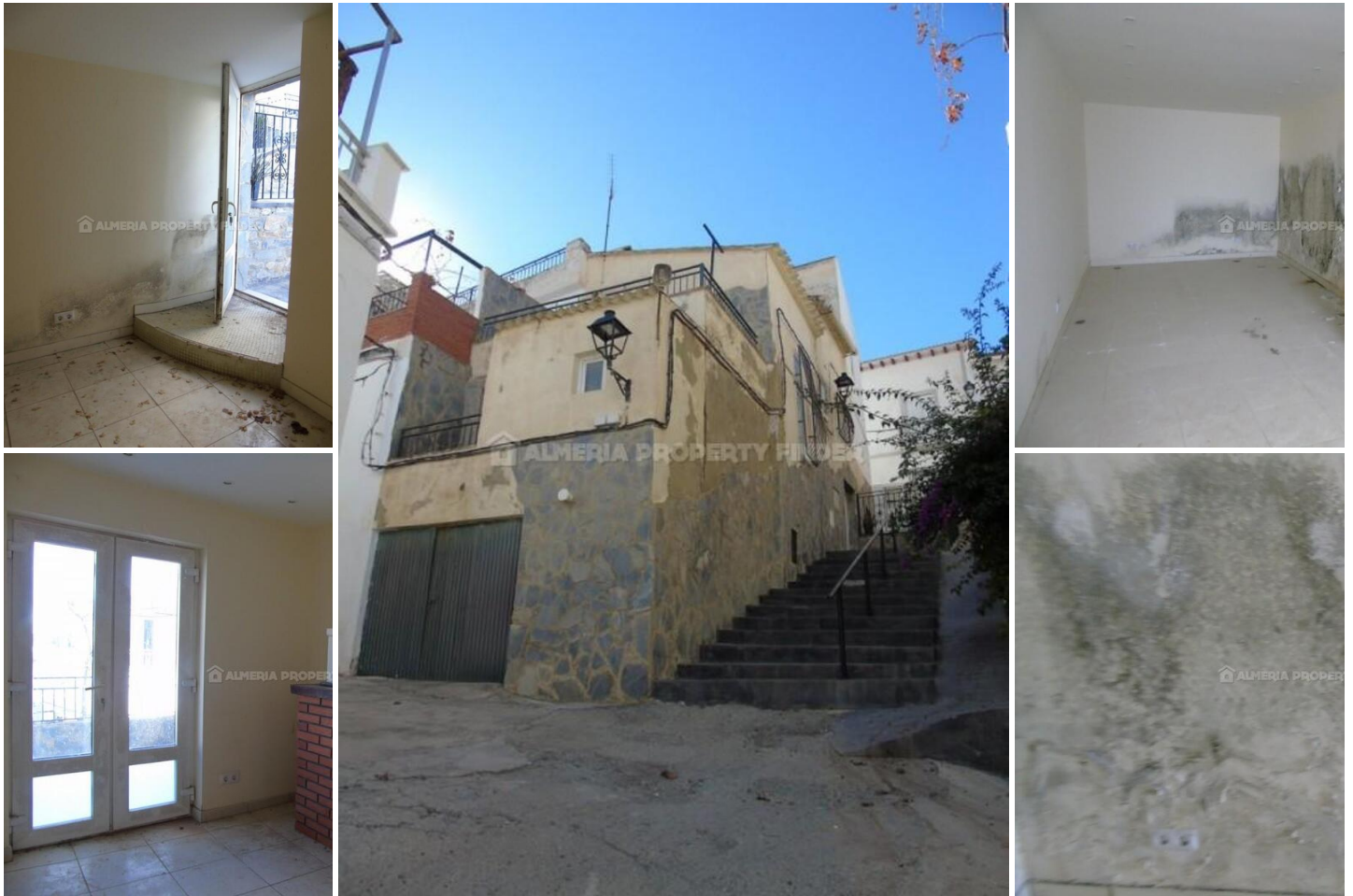
Casa la Mina - A village house in the Purchena area. (Partially Reformed)