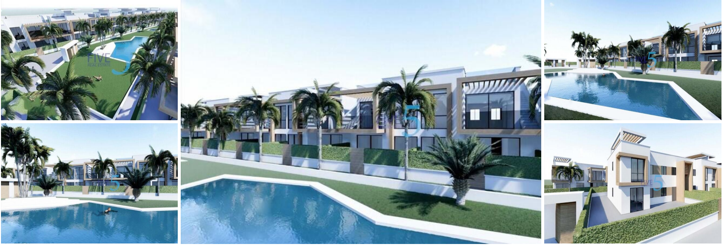
NEW BUILD RESIDENCIAL COMPLEX IN ORIHUELA COSTA

New Build residential complex in Orihuela Costa.