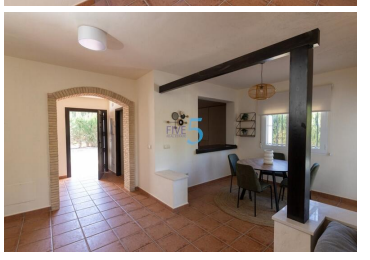
KEY READY SEMI-DETACHED VILLA IN FUENTE ALAMO, MURCIA

Residential of townhouses, independent and semi-detached villas in Fuente Álamo, Murcia.