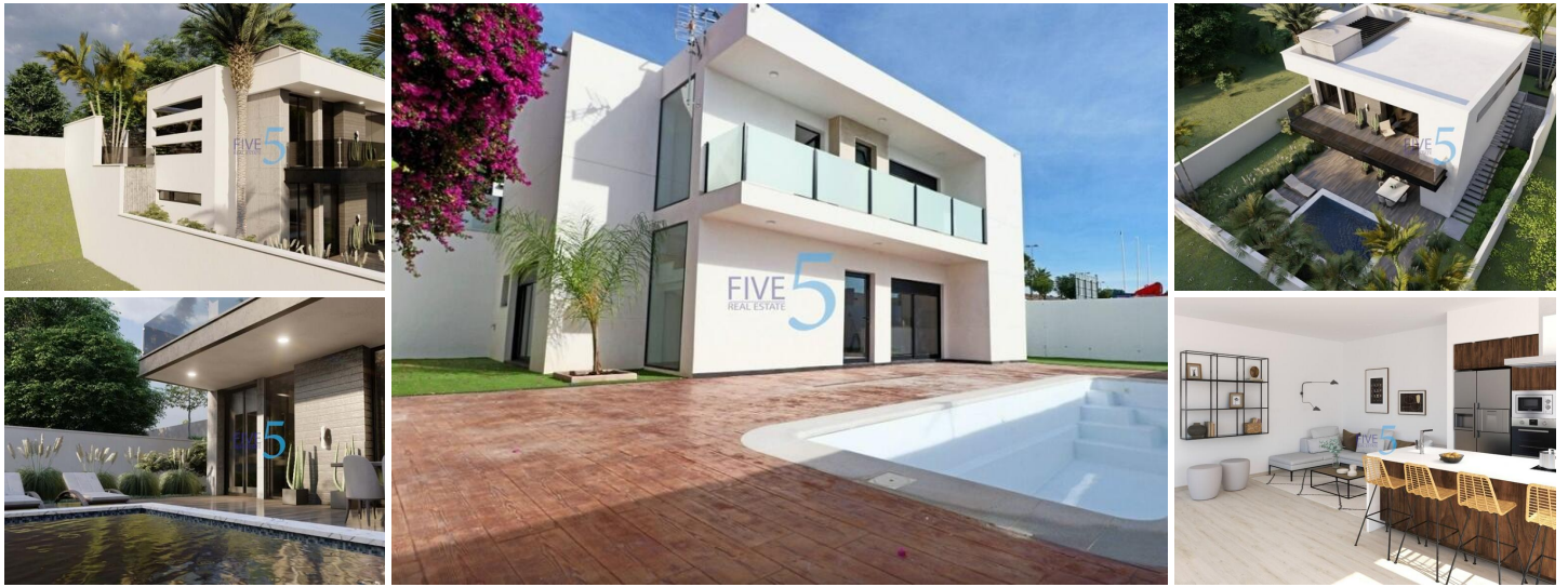
NEW BUILD VILLAS IN FORTUNA