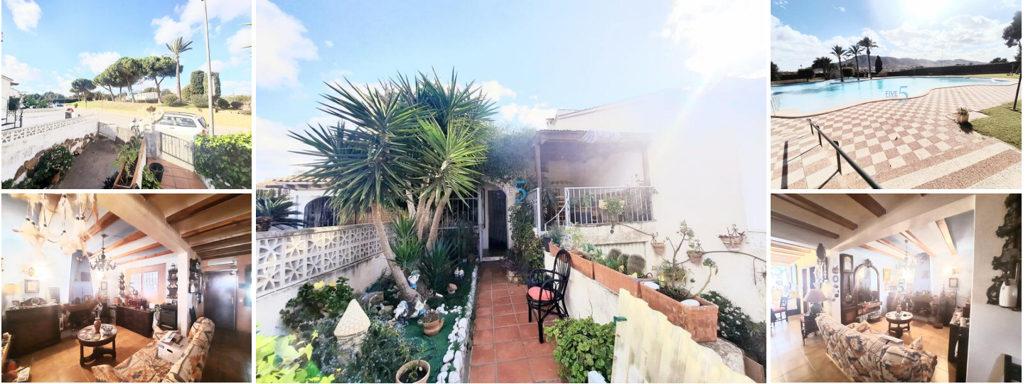
A Cosy 3 Bedroom Town House on the Outskirts of Alfàs del Pi!

We are pleased to present this 3 bedrooms town house located within few minutes drive from stunning Albir beach and all local amenities. This property is situated in one of the quietest villages in the Alicante region - Alfàs del Pi. Only few minutes drive from stunning Albir beach and 15 minutes drive from Benidorm.