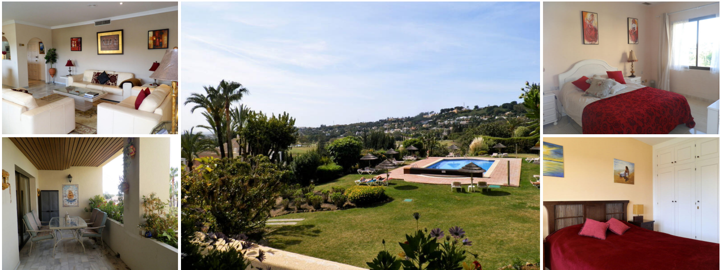
Lovely 2 Bed, 2 Bath Middle Floor Apartment in Hotel Del Golf

Available for winter rental until April. 2022