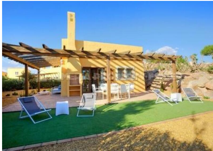
Desert Spring Gold I 12 - A town house in the Cuevas del Almanzora area. (Newly Built)

HOMES WITH MODERN APPEAL REFLECTING THE HERITAGE OF TRADITION WHILST OFFERING A STYLISH CONTEMPORARY FEEL