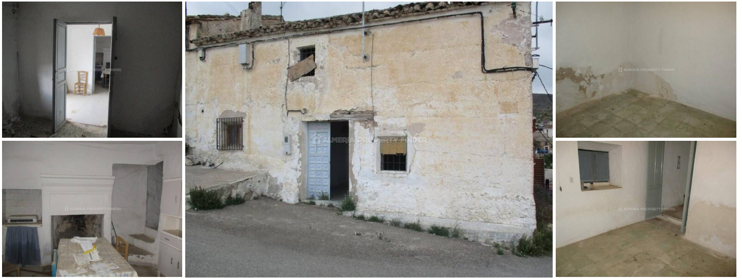
Casa San Lucas - A town house in the Oria area. (For Renovation)

Two storey 3+ bedroom town house for renovation, situated in the traditional town of Oria which offers a range of amenities including tapas bars, restaurants, supermarkets, bakery, butchers, banks, medical centre, and pharmacy. There is also an outdoor municipal swimming pool which is open during the summer months, and a small market every Sunday morning. Oria is just under an hour from the coast, and around 1 hour 20 minutes from Almeria airport.