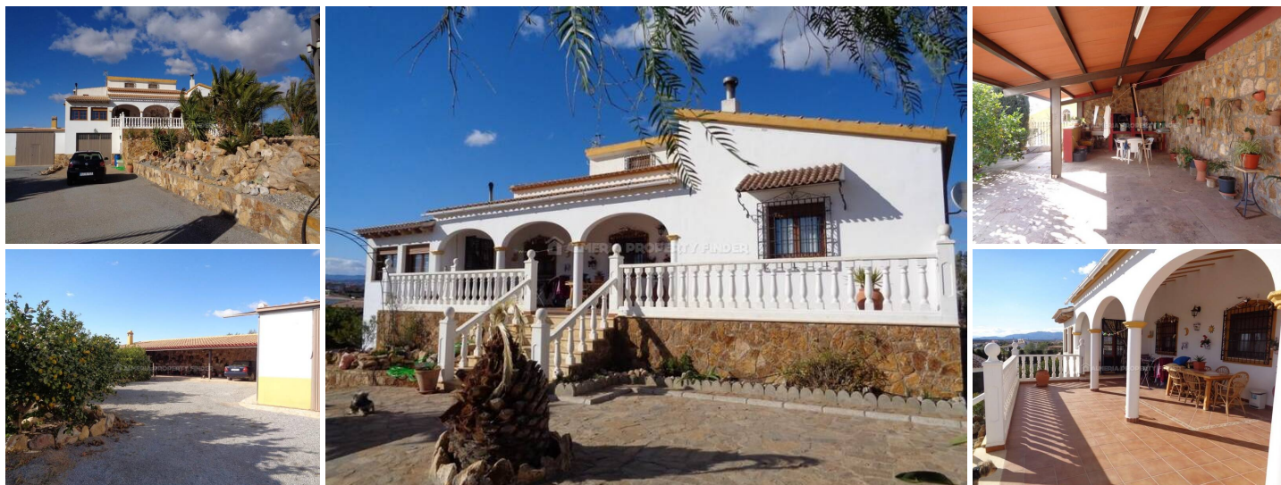
Casa Berbel - A country house in the Albox area. (Resale)

Fantastic detached 7 bedroom country house for sale in Almeria, situated in the Albox area. This huge property has a build size of around 500m 2 , and is set in a plot of 4000m 2 planted with orange, lemon, olive, almond, pear, fig and apple trees, along with grape vines.