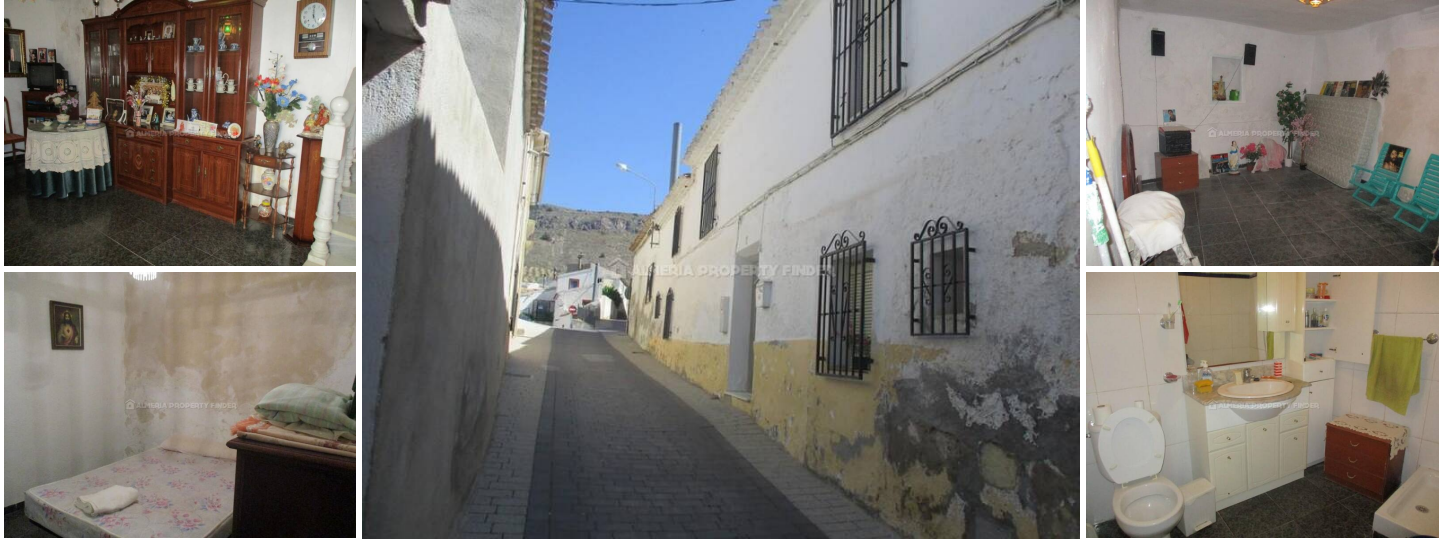
Casa Ramirez - A town house in the Oria area. (Habitable)

Terraced 3+ bedroom town house for sale in Oria, a traditional Spanish town in the Almeria Province which offers a range of amenities including tapas bars, restaurants, supermarkets, bakery, butchers, banks, medical centre, and pharmacy. There is also an outdoor municipal swimming pool which is open during the summer months, and a small market every Sunday morning. Oria is just under an hour from the coast, and around 1 hour 20 minutes from Almeria airport.