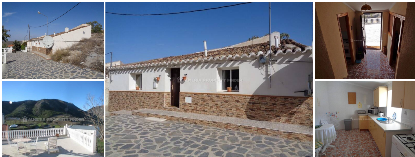
Casa Marie Dos - A village house in the Oria area. (Renovated)

Charming single storey 2 bedroom village house with stunning views, situated in the sleepy hamlet of El Margen, only 3km from a village with bars / restaurants. El Margen is situated around 15 minutes drive from the towns of Oria and Chirivel which offer all amenities.