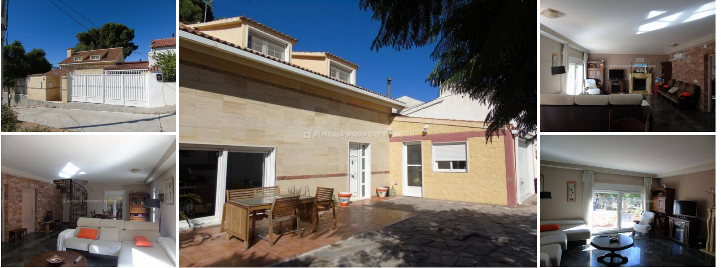
Casa Mari Carmen - A village house in the Purchena area. (Resale)

Modern 3 bedroom, 2 bathroom village house with double garage for sale in Almeria Province, situated between the towns of Olula del Rio & Purchena, both of which offer all amenities. There is also a bar / restaurant within easy walking distance.