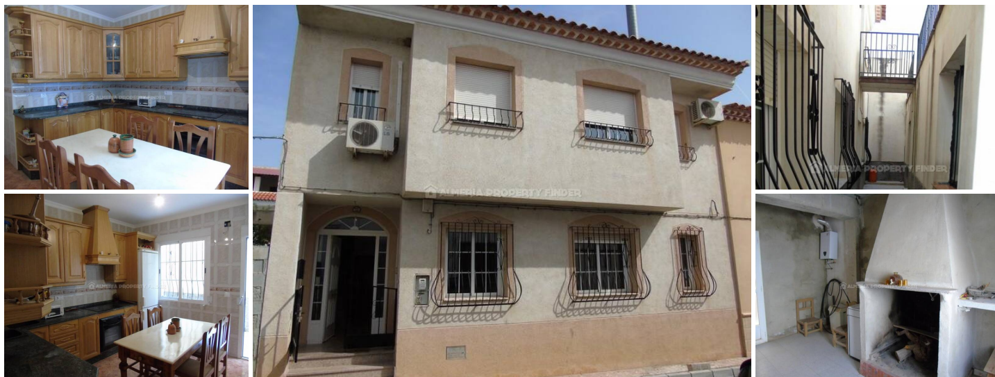
Casa Gloria - A town house in the Chirivel area. (Resale)

Fabulous 5+ bedroom townhouse situated in the lovely town of Chirivel which offers all amenities for daily living. The town has excellent access to the A92 motorway which leads to Granada and the Sierra Nevada ski resort in one direction, and to the coastal motorway and airports of Almeria, Murcia and Alicante in the other direction.