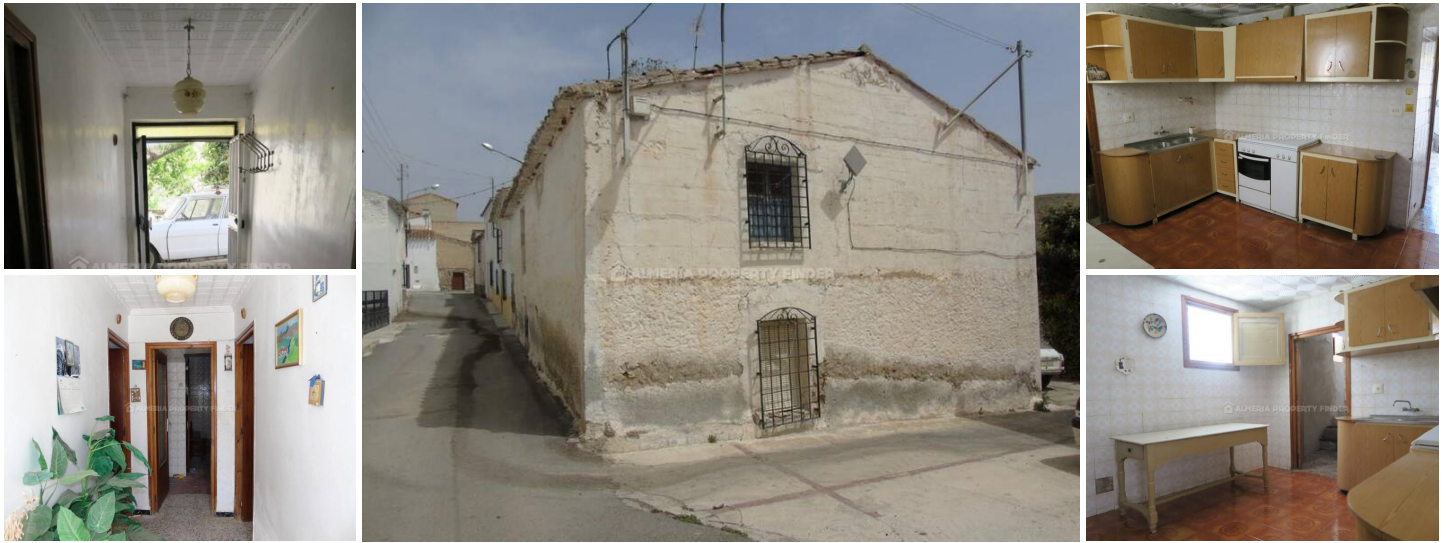
Casa Gloriana - A village house in the Oria area. (For Renovation)

Habitable semi-detached 5 bedroom village house plus a garage and corral, all situated in the village of Los Cerricos, Oria. Each of the properties are on separate plots but near to each other.