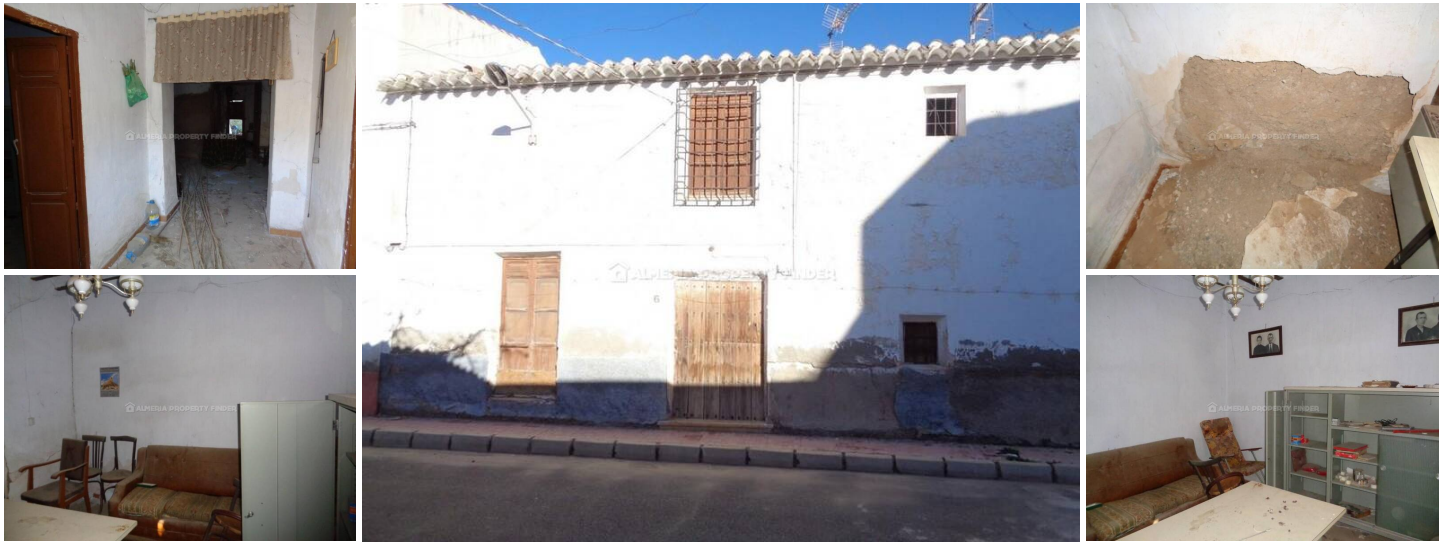
Casa Olivia - A village house in the Albox area. (For Renovation)

Large two storey village house with small garden for complete renovation. This terraced house for sale in Almeria Province is situated in a small village with basic amenities including a bar, bakery and pharmacy. The village is only 10 minutes from the large town of Albox which offers all amenities including shops, supermarkets, banks, schools, cafes, bars, restaurants, sports facilities and a 24 hour medical centre.