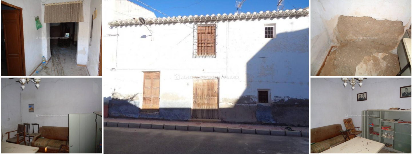
Casa Olivia - A village house in the Albox area. (For Renovation)

Large two storey village house with small garden for complete renovation. This terraced house for sale in Almeria Province is situated in a small village with basic amenities including a bar, bakery and pharmacy. The village is only 10 minutes from the large town of Albox which offers all amenities including shops, supermarkets, banks, schools, cafes, bars, restaurants, sports facilities and a 24 hour medical centre.