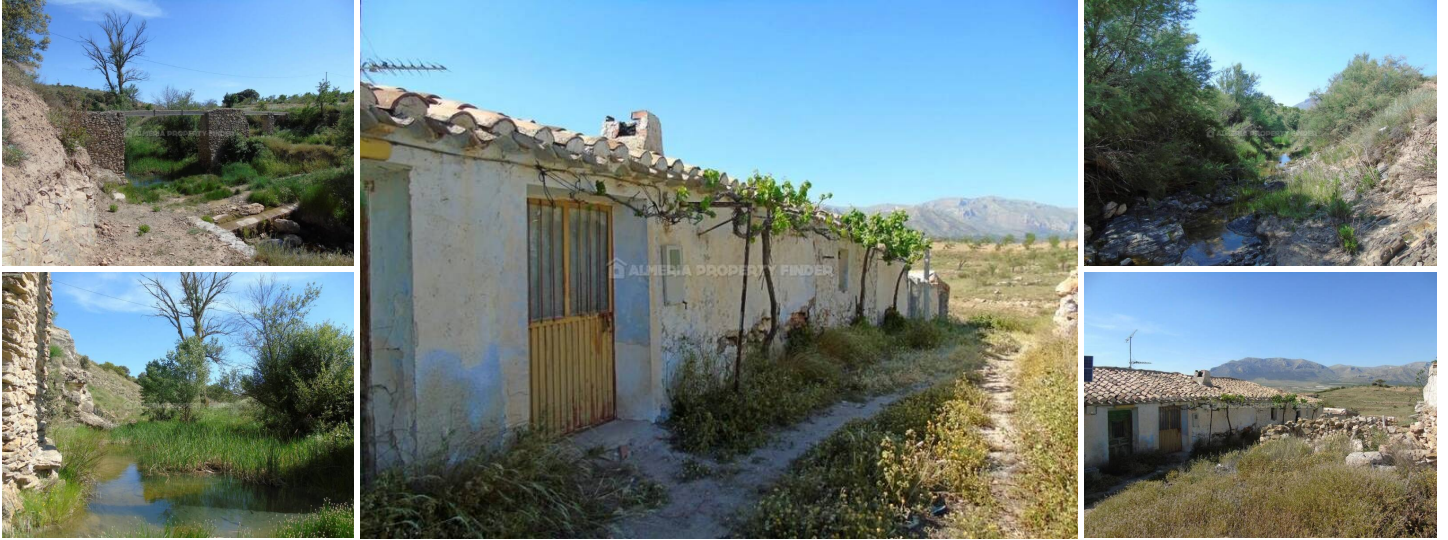
Cortijo Pablillo - A country house in the Chirivel area. (For Renovation)

For complete renovation, this semi-detached single storey country house is in a beautiful rural setting, less than 10 minutes drive from the charming small town of Chirivel which offers all amenities for daily living.