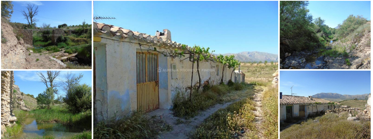
Cortijo Pablillo - A country house in the Chirivel area. (For Renovation)

For complete renovation, this semi-detached single storey country house is in a beautiful rural setting, less than 10 minutes drive from the charming small town of Chirivel which offers all amenities for daily living.