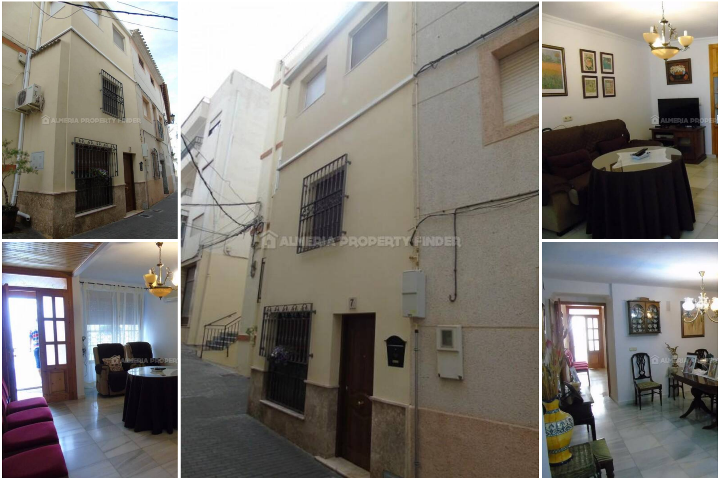
Casa Serrano - A town house in the Albox area. (Renovated)

Three storey 5 bedroom townhouse for sale in Almeria Province, situated in a tranquil street behind the main plaza in the popular market town of Albox. The town offers all amenities including a wide range of shops, supermarkets, banks, cafes, tapas bars, restaurants, schools, sports facilities, a 24 hour medical centre and two weekly markets.