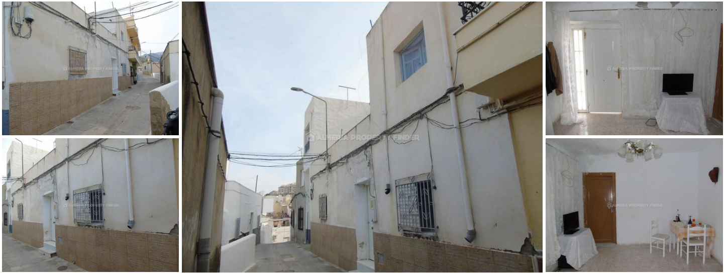
Casa Polvorin - A town house in the Macael area. (Habitable)

REDUCED!!! Two storey 3 bedroom, 2 bathroom town house with roof terrace and courtyard garden, situated in the town of Macael in Almeria Province. Set in a plot of 196m 2 , the house has a total build size of 164m 2 including a large roof terrace with views across the town to the hillsides beyond. There is also 43000m 2 land with olive trees included.