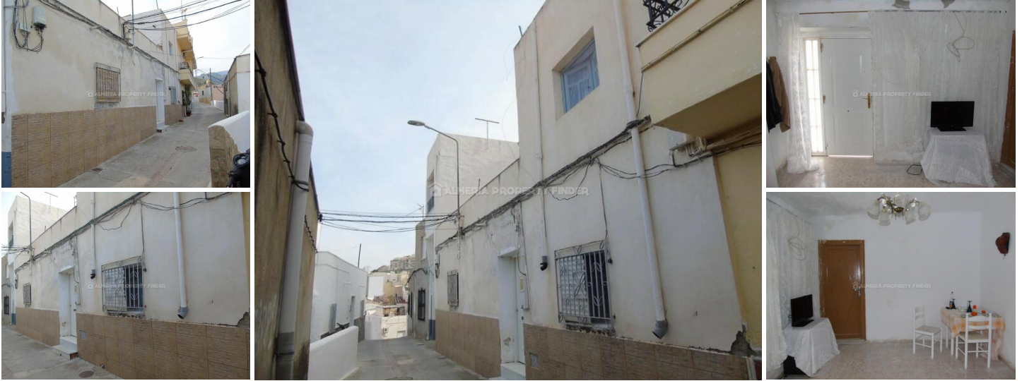
Casa Polvorin - A town house in the Macael area. (Habitable)

REDUCED!!! Two storey 3 bedroom, 2 bathroom town house with roof terrace and courtyard garden, situated in the town of Macael in Almeria Province. Set in a plot of 196m 2 , the house has a total build size of 164m 2 including a large roof terrace with views across the town to the hillsides beyond. There is also 43000m 2 land with olive trees included.