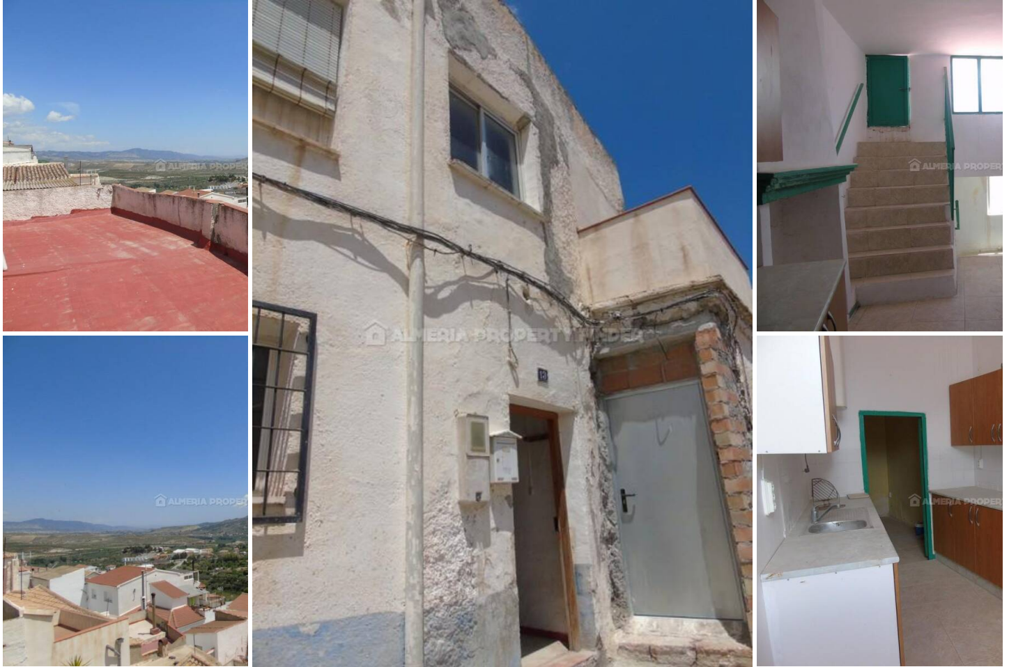
Casa Gemma - A town house in the Seron area. (Habitable)

This is lovely town house set in the heart of Seron, with 3 double bedrooms and is located within walking distance to all the towns facilities, supermarkets, bars, restaurants, medical centre, theatre, castle and so much more.