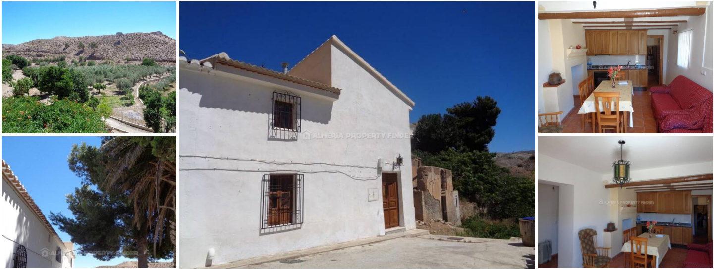
Cortijo Caparros - A country house in the Oria area. (Habitable)

Semi-detached 4+ bedroom cortijo for sale in Almeria Province, situated in the popular Rambla de Oria area. The property has been part renovated and is completely habitable, although further renovation is required to maximise the potential of this large family home.