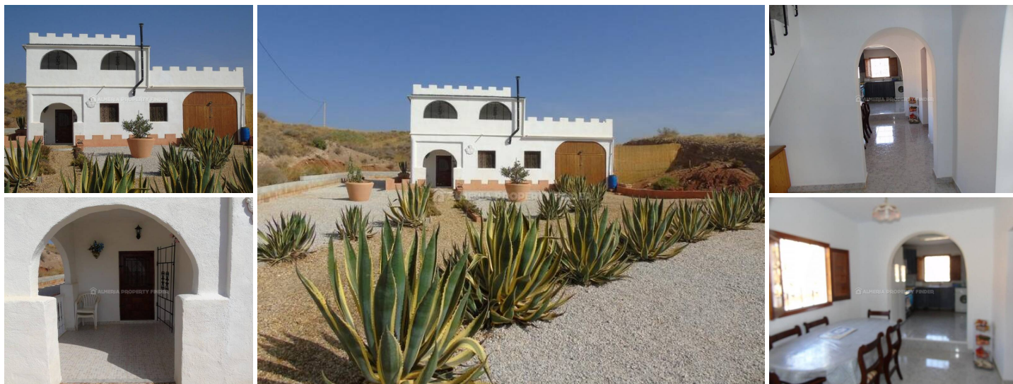
Casa Dash - A country house in the Oria area. (Resale)

Fabulous two storey 3 bedroom country house for sale in Almeria Province, situated in a tranquil rural area of Oria with fantastic far reaching views.