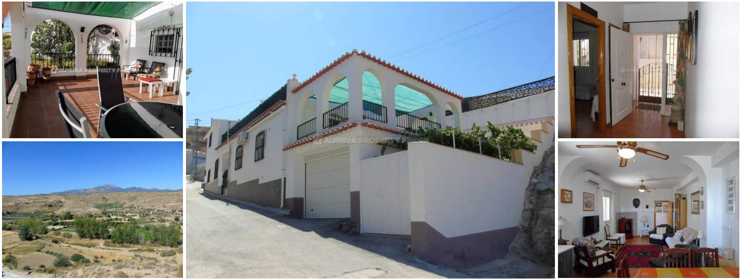
Casa Manzanilla - A country house in the Caniles area. (Renovated)

** REDUCED AND OPEN TO SENSIBLE OFFERS **