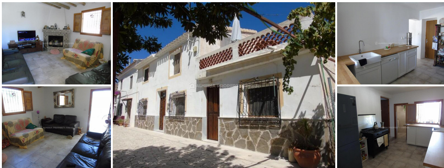
Cortijo La Parra - A village house in the Arboleas area. (Renovated)