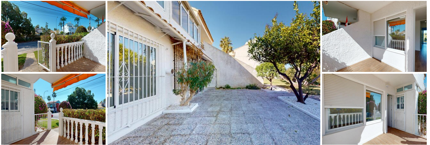
Renovated ground-floor apartment for sale near CC La Rioja in Villamartin

This renovated ground-floor property features a beautiful outdoor space with 2 terraces: 1 at the front, covered and with sun protection, and 1 at the back of 22 m 2 with storage and a view of the communal garden