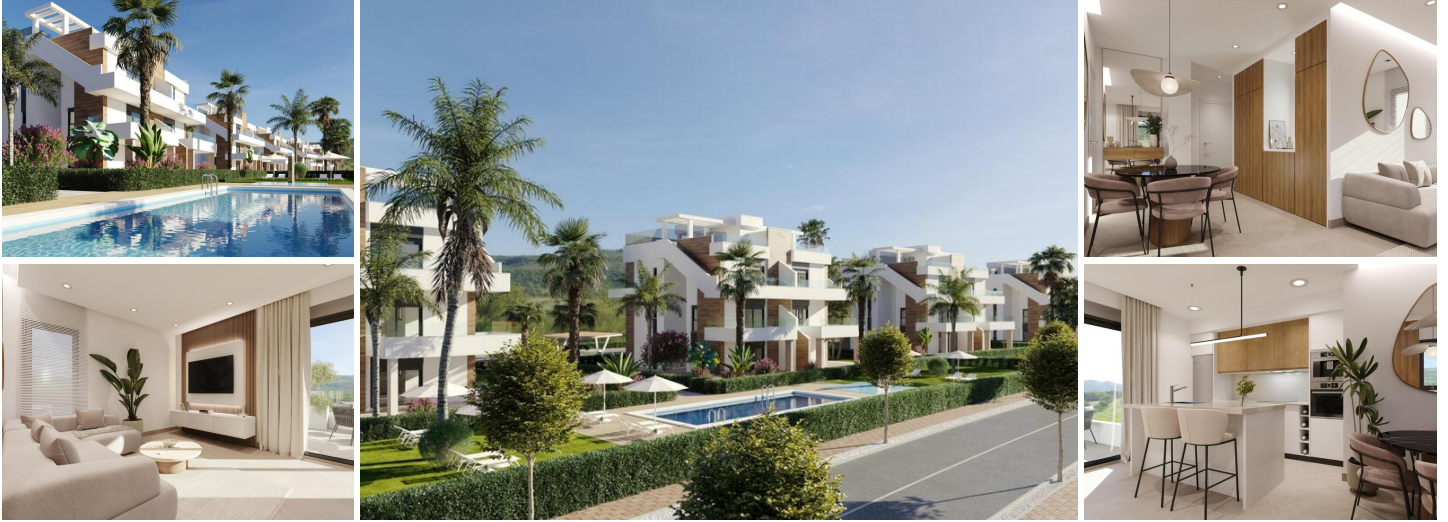
New Build Apartments in Hacienda del Álamo Golf Resort, Murcia