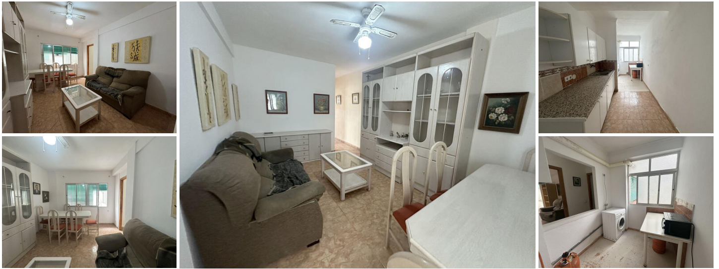
Apartment in San Pedro Pueblo – Strong Investment Potential

Located in the very heart of San Pedro, just steps away from the pedestrian area and surrounded by all kinds of shops, restaurants, and services, we present this excellent opportunity with strong value appreciation potential.