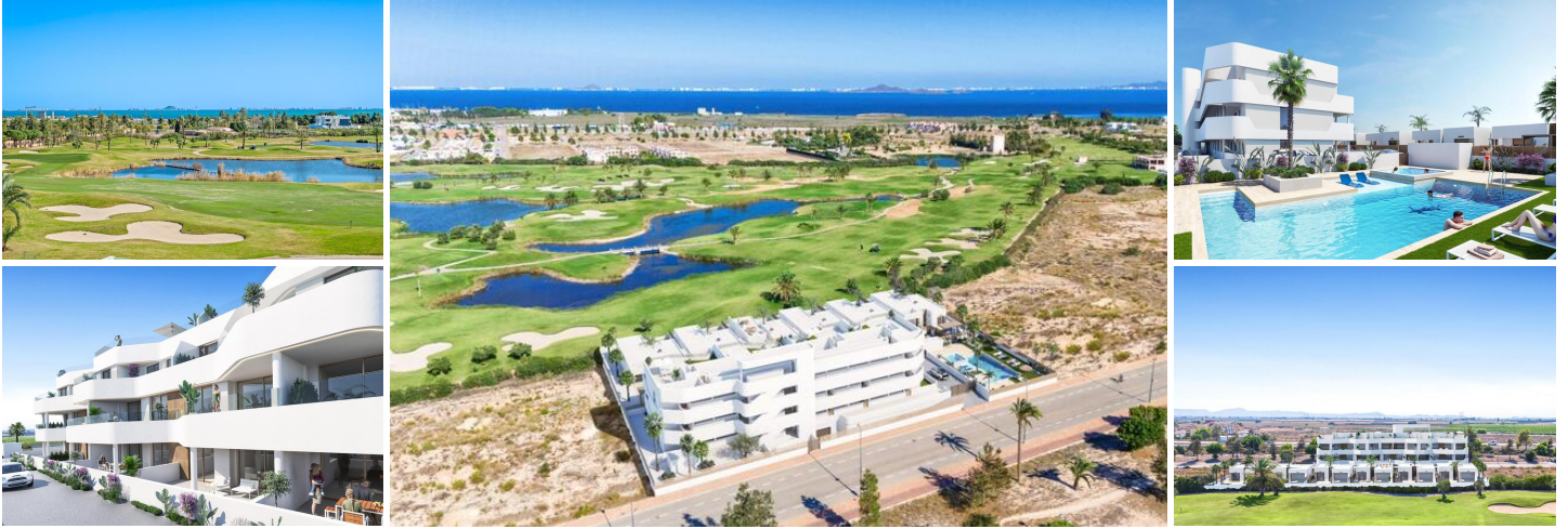
New Build Apartments and Villas Frontline Golf in Los Alcazares Costa Calida