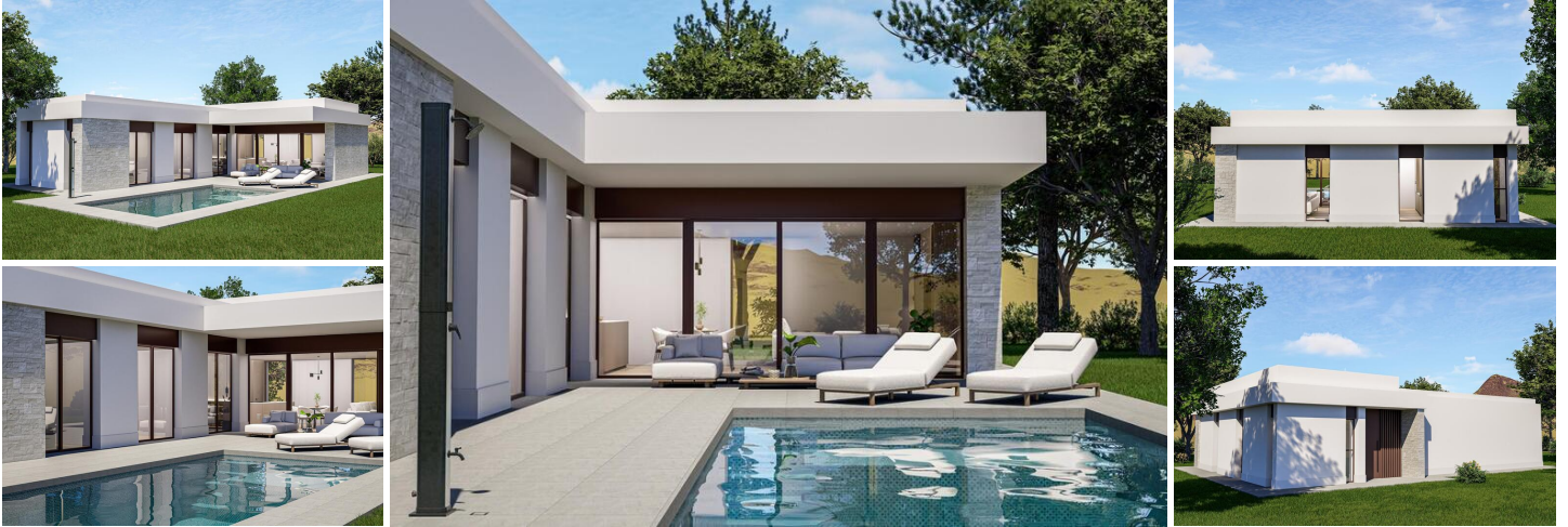
Custom Built New Villas in Pinoso (Alicante): Spacious Homes in Natural Surroundings