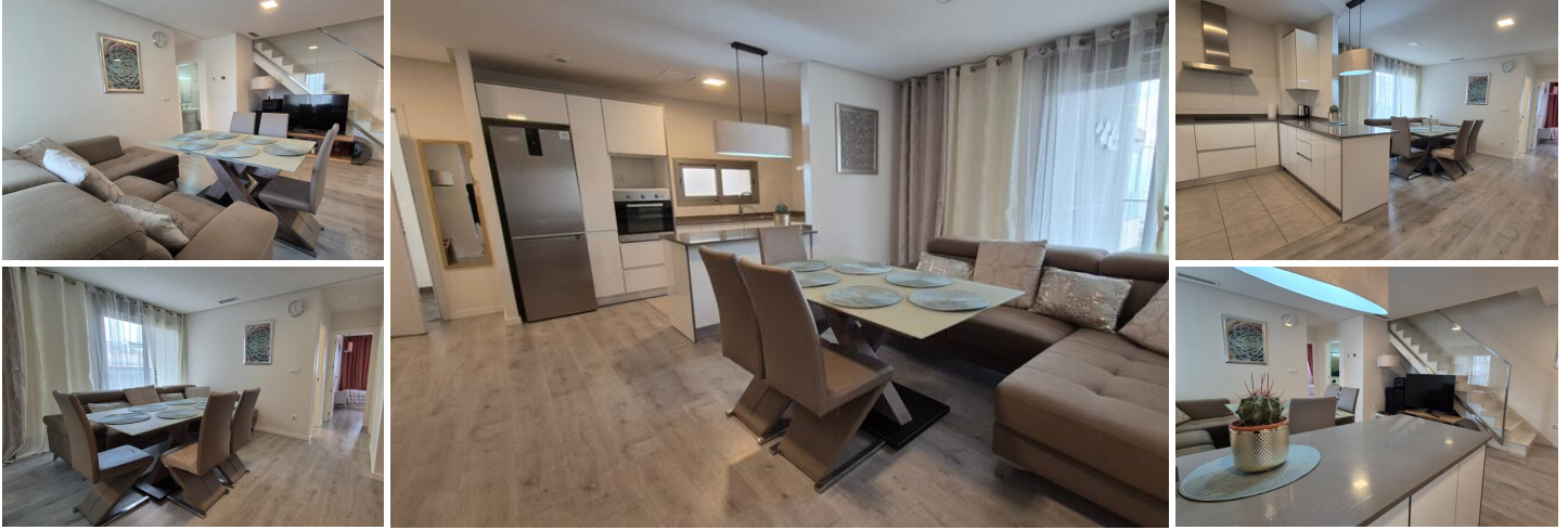
Modern 2-Bedroom Penthouse in La Zenia with Luxurious Amenities

Experience upscale coastal living in this stunning south-facing penthouse located in the heart of La Zenia. This modern 2-bedroom, 2-bathroom home offers a perfect blend of style, comfort, and convenience.