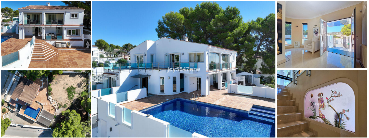
Dream Villa in San Jaime: Luxury, Privacy, and Proximity to the Sea

Located in the popular urbanization of San Jaime, on the border between Moraira and Benissa, you will find this stunning villa. First of all, the corner plot on which the villa sits is equipped with two electric access gates for cars and a pedestrian gate, providing easy access.