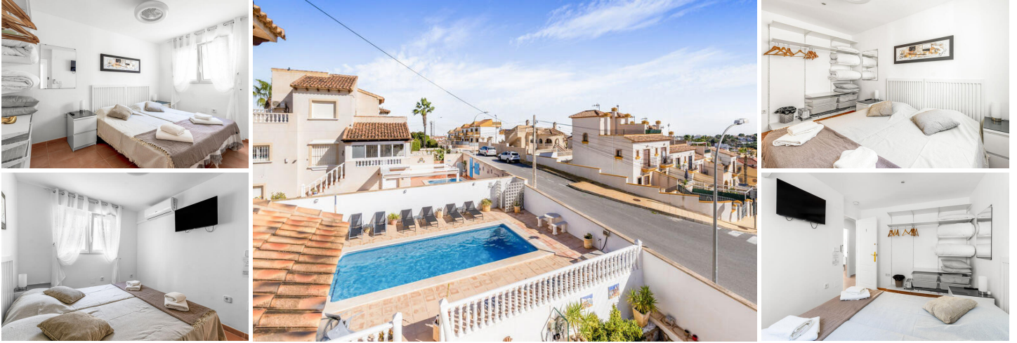
Luxury Villa with Established Bed & Breakfast in Villamartin / San Miguel de Salinas

A rare investment opportunity in one of Costa Blanca's most sought-after locations.