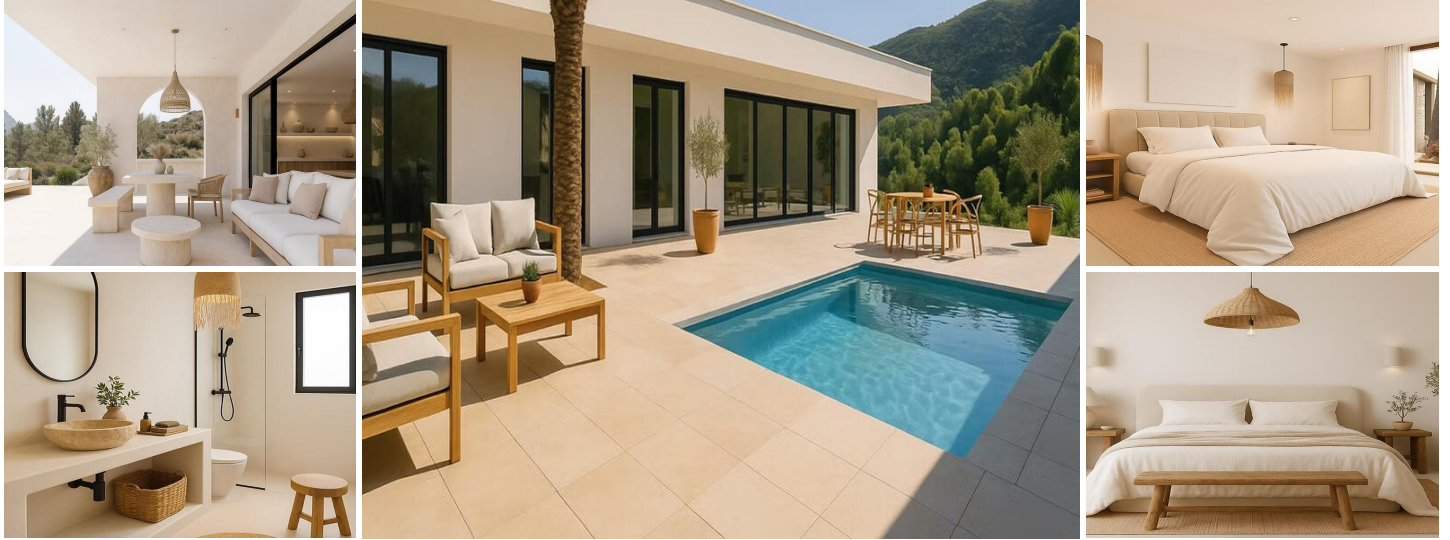
Stunning Ibiza-Style New Build with Panoramic Views – Monte Solana

An exceptional opportunity to build a modern Ibiza-style villa on a sunny south-facing plot in the highly desirable Monte Solana area. With licence already approved and ready to commence construction, this turnkey project offers breathtaking open valley and mountain views and a seamless blend of design, light, and lifestyle.