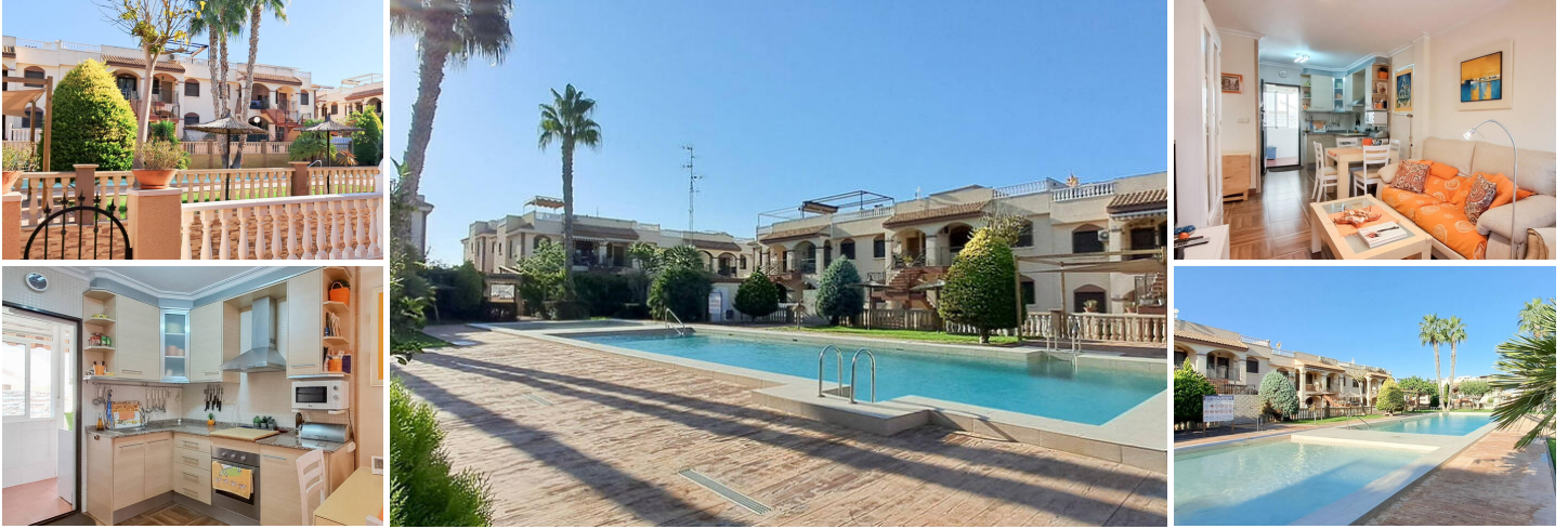
Charming 2-Bedroom Ground Floor Apartment with Pool Views and Private Yard

This beautifully maintained 2-bedroom ground floor apartment is move-in ready and offers a fantastic blend of comfort, convenience, and lifestyle. Located in a peaceful and well-kept gated community just 2 kilometers from the beach, it's the perfect opportunity to own a little slice of paradise.