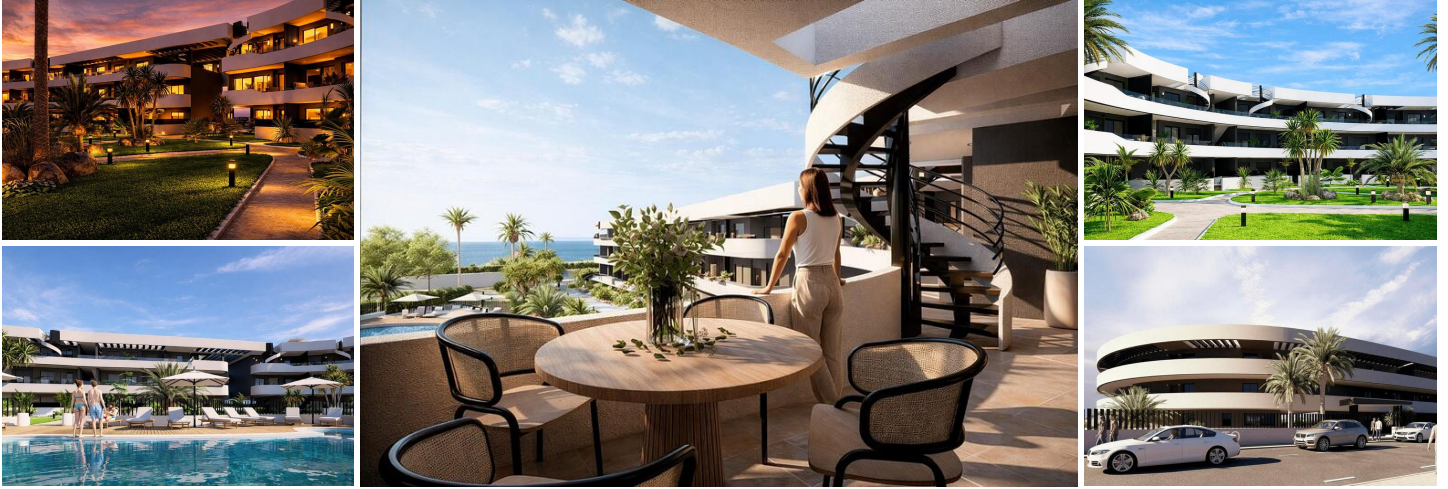
Luxury Golf Front Apartments Near the Sea in Los Alcazares Costa Calida