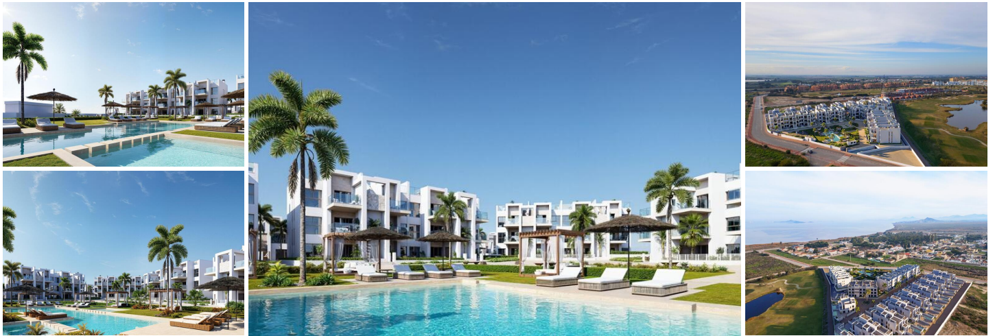
New Build Resort Apartments at La Serena Golf-Los Alcazares Near the Beach