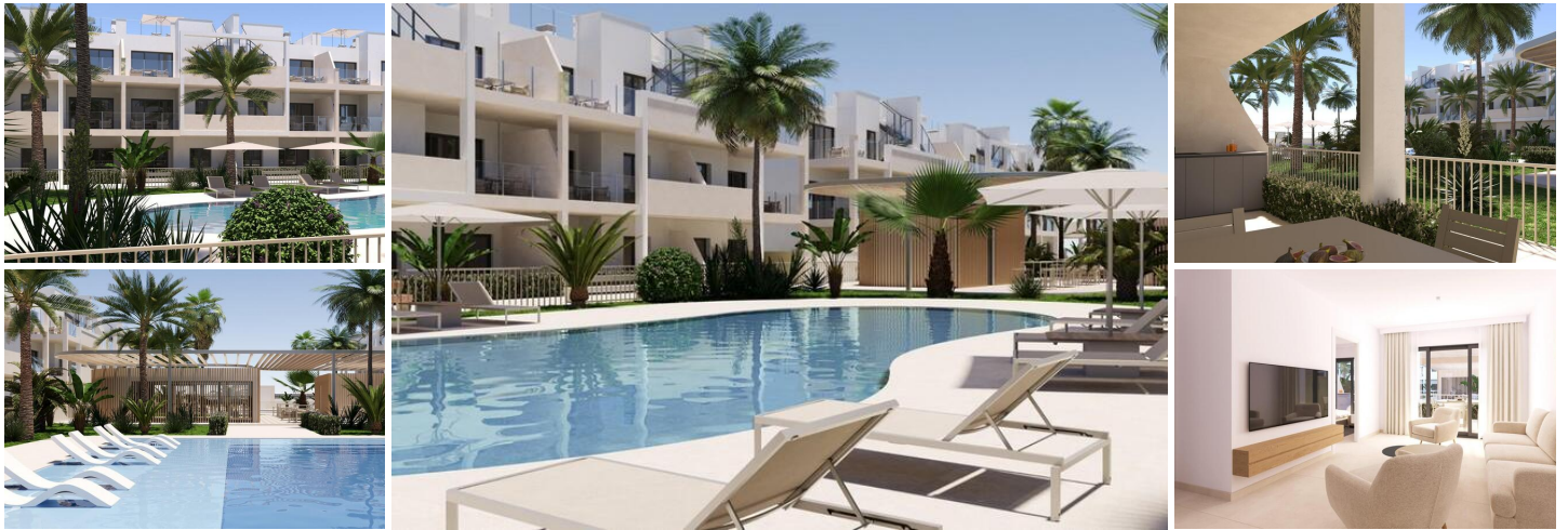
Modern New Build Apartments in San Cayetano, Torrepacheco, Murcia