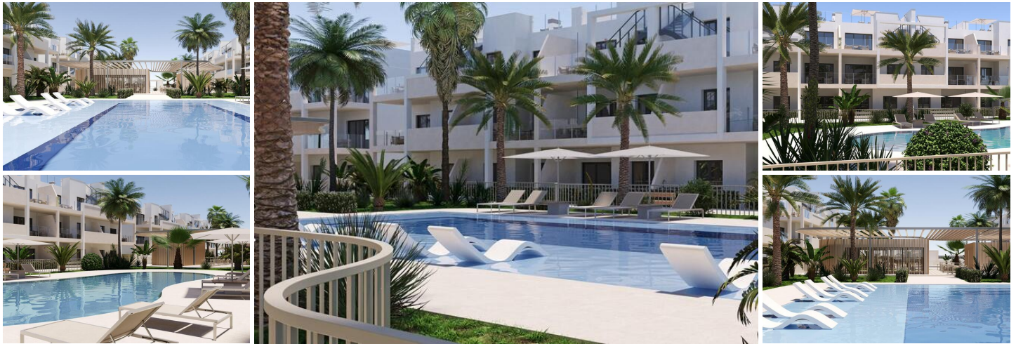
Modern New Build Apartments in San Cayetano, Torrepacheco, Murcia